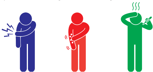
Nawdoum/vodjirle Gnagnare Pabbodje

Wobbe hebi bononda pamare bawo toufaaga baatal faddagal Doum yambitan ha gnaldere ko gnalade didi