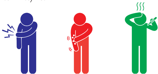
Mob/Liab Pob Me Ntsis Ua Npaws

Tej txhia neeg muaj mob tshwm sim me ntsis tom qab tau cov koob txhaj tshuaj. Cov no yuav ploj mus li ntawm ib los yog ob hnub tom ntej no.